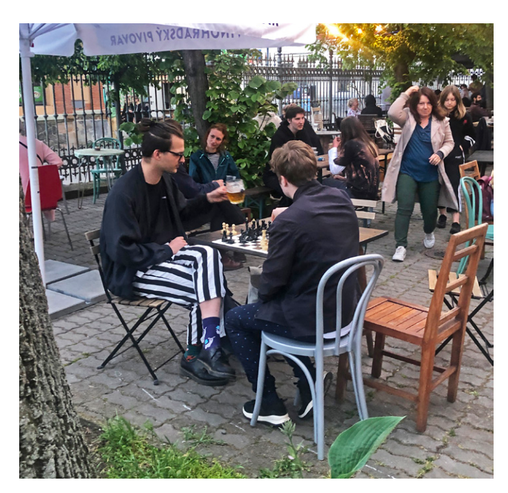
Figure 13. Photo from another music event held on the same day at the Prague Market. Young people sit in a beer garden playing chess, with electronic music playing in the background.

reminded by different Ukrainian cultural attributes concentrated in the festival place, fancifully collected as in a kaleidoscope: borscht, holubtsi , <sup>11</sup> vyshyvanka, and products from Ukrainian companies such as ROSHEN candies, Shabo wine, and cognac (Figure 4). According to my conversations with Czech guests, it reminds them of events on Prague's náplavka ("riverbank"), where the cuisines of different cultures are presented, or cultural festivals on squares in different districts of Prague, usually supported by embassies.