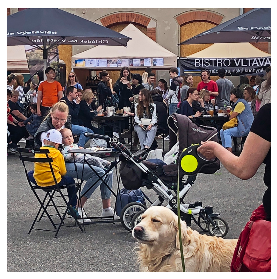
Figure 2. The main audience – women with kids, teenagers, and older people – are resting, eating, or waiting in the line to the food tent.

"Look, there's borscht and varenyky <sup>3</sup> here! One hundred rubles<sup>4</sup> each, or whatever they are called – korunas!" a woman says to a friend.