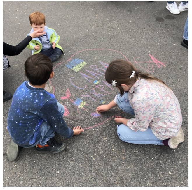
Figure 8. Children drawings with coloured crayons: Ukrainian flags and the national salute "Glory to Ukraine".