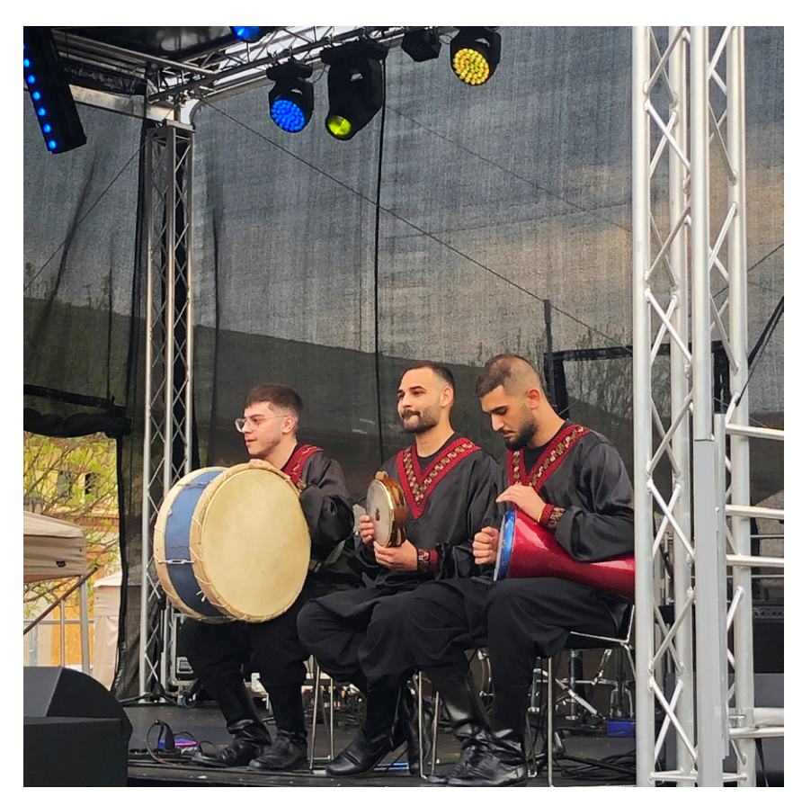
Figure 11. The performance of the Al-Sarres Dabkeh, a Palestinian folklore dance group from Israel.

In the initial announcement, the host clarified that the Al-Sarres Dabkeh dance group was from Palestine. She spoke in Czech, so this was not thoroughly understood by many Ukrainians in the audience. By some Czechs too. "Look, son, these are Iranian dances", one mom explained in Czech during the group's performance.