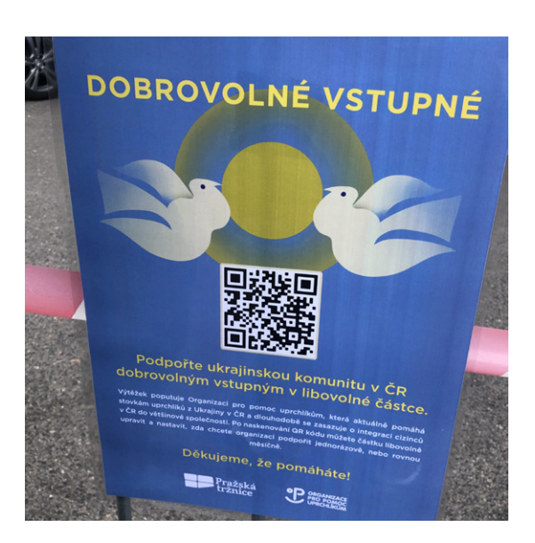
Figure 1. Guests are greeted by a blue stand with a yellow sun and white doves, a large headline about the voluntary entry fee, and a QR code to support Ukrainian refugees.

festival within the marketplace. The stage is ahead. From the entrance on the way to the stage, there is a kind of passage – with tents mostly on the left side and a bigger zone with sitting places. The tents sell street food: Bistro Vltava, Vína a destiláty z Ukrajiny (Wines and Distillates from Ukraine) (Figure 4), Pivovar Ládví Cobolis (Brewery Ládví Cobolis), and Ethnocathering. In front of these food tents, in the central area of the square, there are wooden tables with benches for families or large groups. Behind them – small black folding tables and chairs (from the #Pražskéžidle [#Praguechairs] brand), which can be found in various public places around Prague, on squares, and near fountains and libraries (Figure 2). There are also several food tents near the entrance, such as Chef Parade and mamacoffee. They are located far from the stage, on the opposite side. All seats are already taken when I arrive, even though the event starts at 16:00.