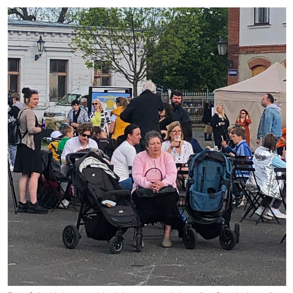
Figure 9. An elderly woman sitting in between empty baby strollers.

The first drawings with crayons are Ukrainian flags and the patriotic phrase "Glory to Ukraine" (Слава Украине) written in Russian (Figure 8). Children in this "triangle" are left to their own creativity. Parents and grandparents are probably taking their time to relax, waiting in lines for food, occasionally observing their children from afar (Figure 9). At one moment, I notice the only interaction between adults and children in the playground space: one man from the Palestinian dancing group takes a crayon, draws a hopscotch, and starts jumping it with the children, cheering them on and applauding. Judging by the