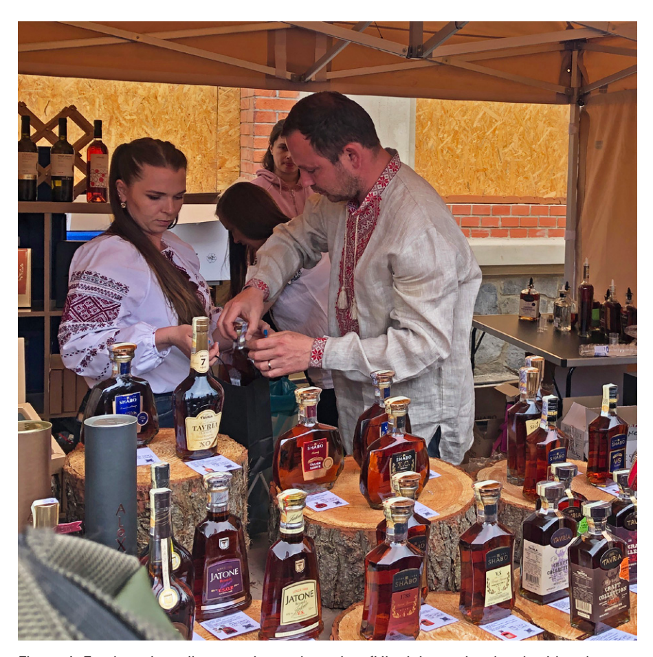
Figure 4. Food vendor sellers wearing vyshyvankas (Ukrainian national embroidered shirts). They are selling Ukrainian products, cognac, wine, and candies.

body's resources and prevent a quick switch to a mode of readiness to respond to a threat.