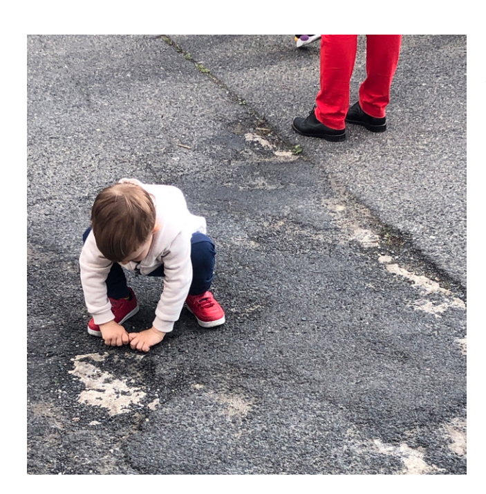
Figure 7. The kid plays with stones.