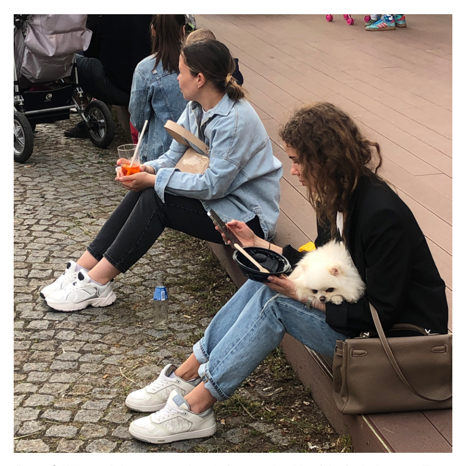
Figure 6. Women sitting on a wooden platform on the side of the festival square. There are not enough chairs and tables at the festival.

tables sit down on a wooden platform at the end of the festival square (Figure 6). Elderly women who came with their grandchildren often lean on fences.