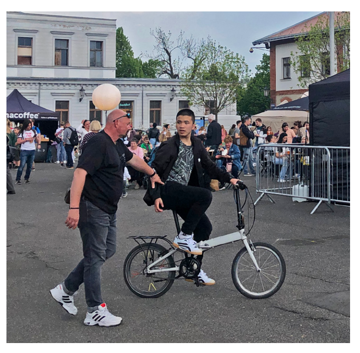
Figure 14. A security guard stops a Vietnamese boy and tells him not to ride a bicycle on the festival grounds. Vietnamese shops form a big part of the Prague Market.

music events are taking place in other areas of the marketplace simultaneously with the Ukrainian culture festival. A block behind the building separating the square from the other areas of the market space, there is a food truck with burgers and background jazz music. A block further away, young people hang out in a beer garden, where an electronic dance music is accompanying a live female vocal performer. At one of the tables, guys are playing chess (Figure 13). Both of these market sites are smaller and cosier, better suited for socializing and networking.