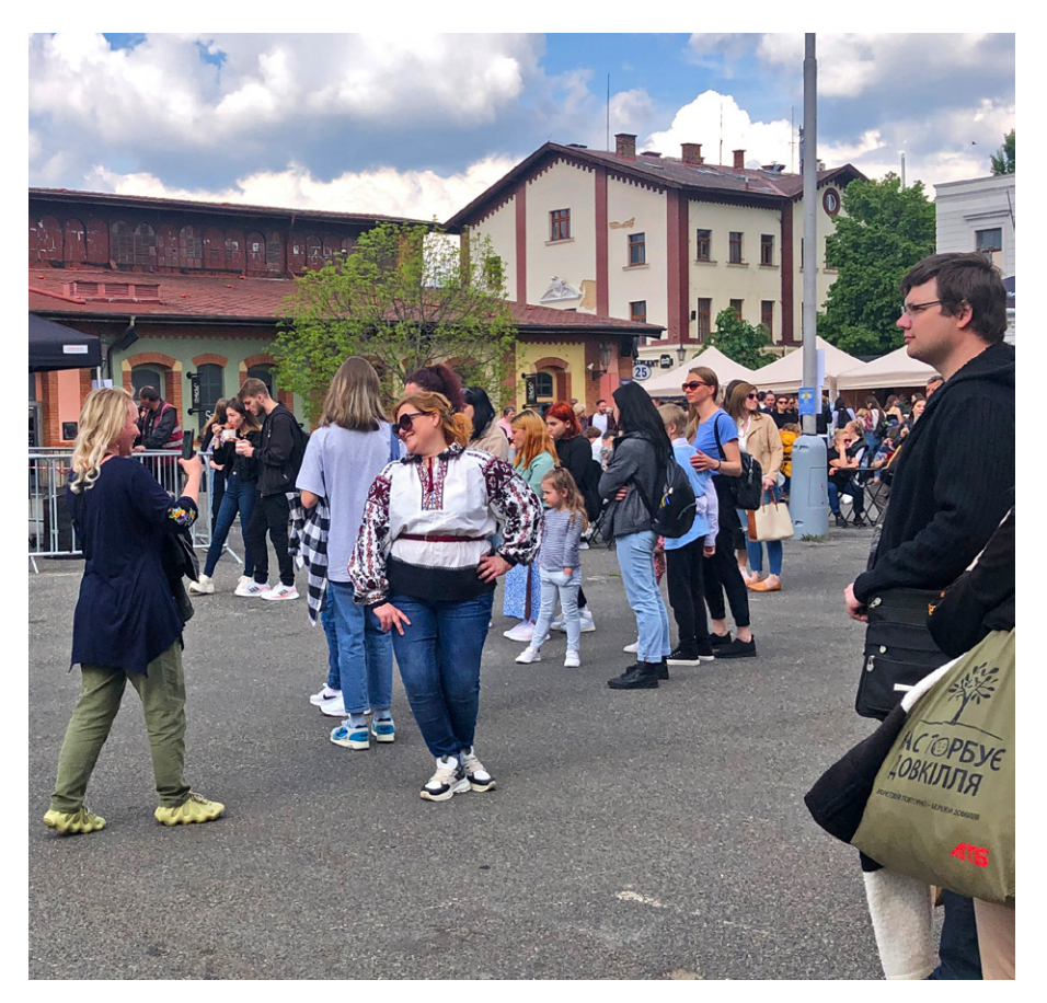
Figure 5. A Ukrainian woman takes a photo in a vyshyvanka (a national embroidered shirt). On the bottom right of the photo, there is a shopping bag with a sign: "The environment worries us" – a slogan of one of the biggest supermarket chains in Ukraine.

Among the Czechs and other attendees of the festival, I see some guests who wear clothes and accessories that demonstrate their support of Ukrainians. One woman came in a T-shirt with a print Respekt Ukrajině ("Respect for Ukraine"). One Czech male wears a bracelet with Ukrainian flag colours. Ayoung girl, probably a student, sports blue and yellow socks.