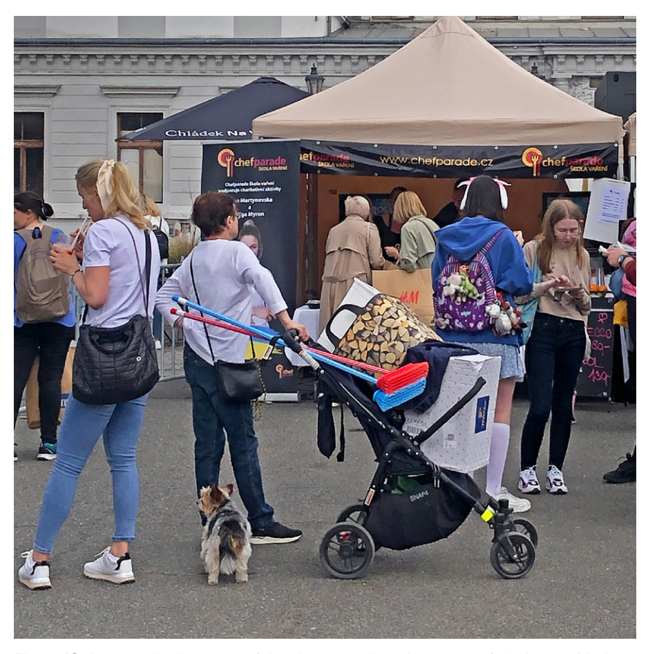
Figure 12. A woman in the centre of the photo was shopping at one of the Prague Market stores and has mops and shopping boxes in the pram.

Thunder rumbles, and it starts getting cold around 18:30. The forecast app on my phone shows a high chance of rain. I am checking places where people could go to hide during the rain. A small part of them hides under large festival umbrellas, while many others scatter to the indoor market areas surrounding the festival square. Many guests already visited the market and hardware stores before the beginning of the festival: there are bags with vegetables next to them. Someone has two cleaning mops and some additional shopping boxes placed in a pram (Figure 12).