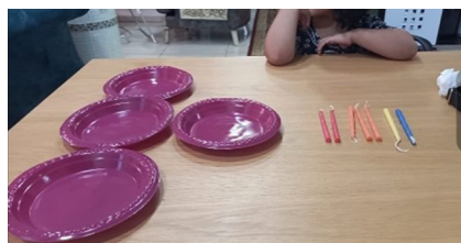
Fig. 4: Are there more plates or candles or is there the same amount?

Regarding how objects were laid out, we noted a variety of setups: each group of items was spread out on different sides of the table (see Fig. 4), each group was bunched together in separate piles, or one group was bunched up and one was laid out in a row. Michelle, who used cup and straws, explained how she chose her setup, "I thought about it in advance, to place the cups in a group and the straws in a row. Because my son is comparatively old (he's five), I wanted to raise the level of difficulty and thought about not placing the items one directly in front of the other." Not wanting to make one-to-one correspondence immediately obvious, Michelle considers the layout of the objects. Another participant (Natasha), who had spread out cups and coffee capsules on the table, reported that her child placed one coffee capsule in each cup when deciding which set had more. She was curious and wrote, "I wonder what the child would have done if the cups were placed one inside another." Natasha is also thinking about how the setup might impact on the child's actions" (Cells 3 and 4 of the framework).