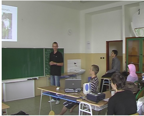
Figure 1: Students' presentations